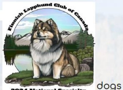
2024 National Specialty Kelowna B.C.