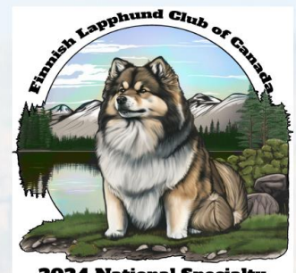
2024 National Specialty Kelowna B.C.