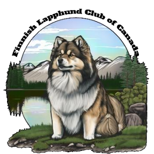
2024 National Specialty Relowna B.C.

ENTRIES CLOSE: WEDNESDAY, May 1<sup>st</sup>, 2024 @ 9:00pm Pacific Time